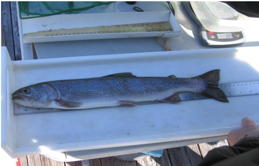
Lake Sammamish Cutthroat Trout #1 4/17/2009

In order to continue all of this great work we need your help. Please support our volunteer efforts by adopting a fish. With a $100 donation we will send you a picture 8" X 11" of one of the fish we catch and tag. Along with this photo you will receive its vital statistics, where it was caught and information regarding its life history. You will also receive a periodic record of its movement as we track them around the lake.