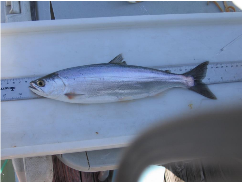
Lake Sammamish Kokanee #1 4/17/2009

Since October 2006, the Bellevue/Issaquah Chapter of Trout Unlimited in cooperation with Save Lake Sammamish, the City of Issaquah, local Boy Scout Troop 366, the Issaquah High Roots and Shoots Club, the King Co. Department of Natural Resources, the Wild Fish Conservancy, the Washington Department of Fish & Wildlife and the U.S. Fish and Wildlife Service has been working to protect and restore the Lake Sammamish kokanee. These projects include habitat restoration, trapping and counting out migrating fry, placing acoustical tags on native Kokanee, Cutthroat Trout, Small Mouth Bass and Northern Pike Minnow and tracking their movement throughout the Lake Sammamish watershed through the placement of listening stations throughout the lake and its tributaries, and educational signage and literature. The data we collect, the habitat we restore, and the raising of public awareness is vital if we are to save our kokanee.