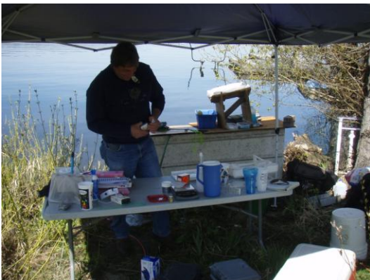
Lake Sammamish Field Station

Over 20 cutthroat and 12 kokanee were captured. After capture the fish were quickly shuttled to the onshore field station.