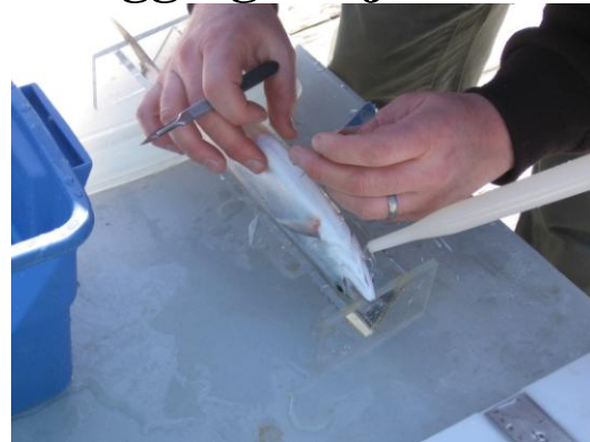
Kokanee being fitted with acoustic tag.

The Lake Sammamish Fish Tagging Project has completed its first phase with over 20 kokanee and cutthroat trout captured, tagged with acoustic transmitters and released. Volunteers logged over 150 hrs in April. They caught fish, maintained captured fish, put in tags and helped the fish recover to be released. Trout Unlimited greatly appreciates their time and efforts!