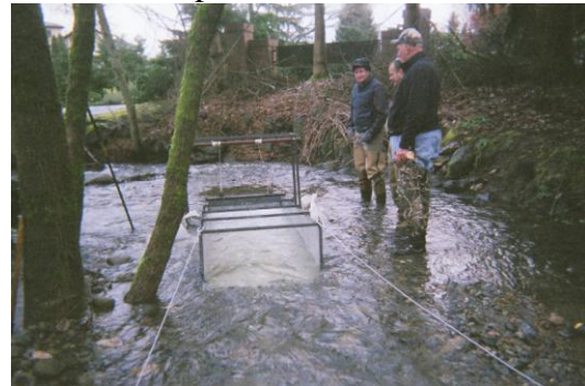
Lewis Creek Fry Trap

are quite significant, even with extensive volunteer help.