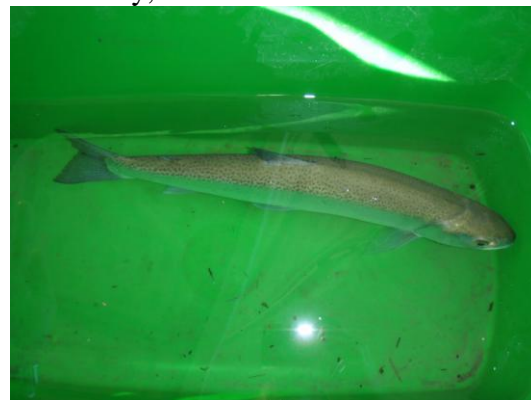
Kokanee about to be released.

Once onshore the fish were placed in the aerated holding tank for observation. Fish found to be in good condition were weighed, measured and fitted internally with a tiny, acoustic transmitter.